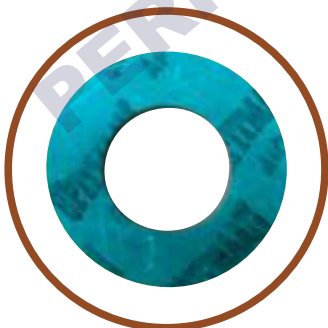
AF-120 SPITMAAN CHAMPION