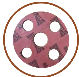
CAF SPITMAAN CHAMPION

*Owing to continuous improvements, product specifications and dimensions are subject to change