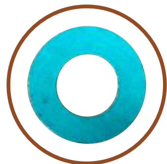
KLINGER SIL 4430