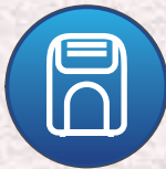
HVAC & Utilities